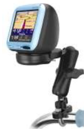
RAM-B-149Z-T01U Handlebar or Rail Mount

INCLUDED COMPONENTS: (1) RAM-B-202U-T01 (1) RAM-B-201U (1) RAM-B-231ZU