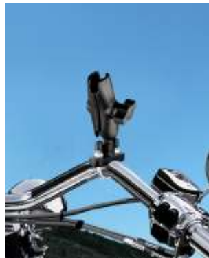
STEP 2 Choose Arm