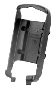
Garmin Cradles: (Page 4-34) TomTom Cradles: (Page 35-43) Magellan Cradles: (Page 44-55) Lowrance Cradles: (Page 56-64) Delorme Cradles: (Page 65-67) Spot Satellite Cradles: (Page 68-70) Mio Cradles: (Page 71-74) Aqua Boxes: (Page 81)

Note: Most cradles contain hole patterns that match with the diamond bases. Aqua Boxes utilize the round base for attachment.