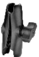
RAM-B-201U RAM 3" Standard Length Double 1" Socket Arm