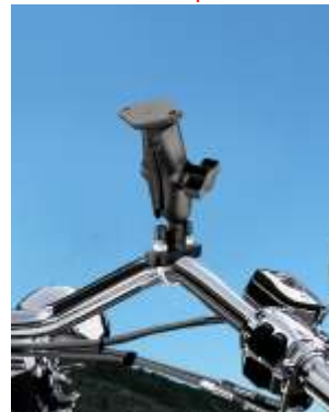
STEP 3 Choose Top Base