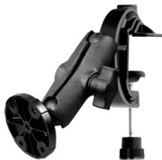
RAP-B-121-G1U Combination Composite Aviation Yoke, Glare Shield Mount