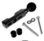
RAM-B-309-1U RAM Motorcycle Brake/Clutch Reservoir Base