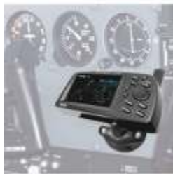
RAP-SB-178-G1U PSA Adhesive Flex Stick Base Mount