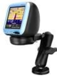
RAM-B-138-339-T01U Flat Surface, Magnetic Base Mount

INCLUDED COMPONENTS: (1) RAM-B-202U-T01 (1) RAM-B-201U (1) RAM-B-202U (1) RAP-339U