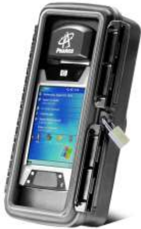
RAM-HOL-AQ1U RAM Large Size Aqua Box