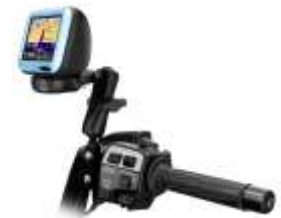
RAM-B-174-T01U Brake/Clutch Reservoir Mount

INCLUDED COMPONENTS: (1) RAM-B-202U-T01 (1) RAM-B-201U (1) RAM-B-309-1U