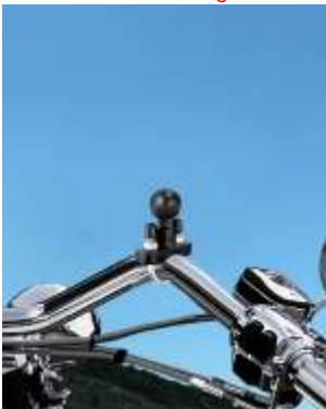
STEP 1 Choose Mounting Base