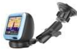
RAM-B-166-T01U Twist Lock, Suction Cup Mount

INCLUDED COMPONENTS: (1) RAM-B-202U-T01 (1) RAM-B-201U (1) RAM-B-224-1U