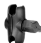
RAM-B-201-A RAM 1.75" Short Length Double 1" Socket Arm