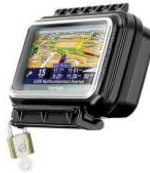
RAM-HOL-AQ6U RAM Medium Wide Size Aqua Box