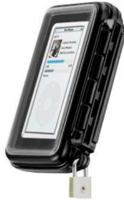
RAM-HOL-AQ2U RAM Medium Size Aqua Box